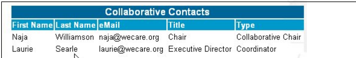
Figure 1.3 Collaborative Contacts - Select Coordinator

Collaborative Contacts page opens (Figure 1.3)