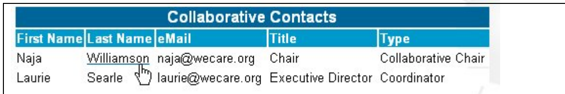
Figure 1.5 Collaborative Contacts – Select Chair

Collaborative Contacts page opens (Figure 1.5)