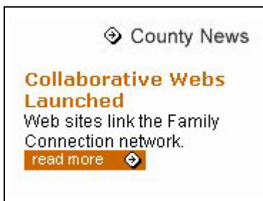
Figure 3.1 County News Categories

Categories are perfect for adding news stories to your News page. Since the News page also gives you an option to display the stories on your Home Page under County News, be sure to keep a tight format, as illustrated in Exercise B and Figure 3.1.