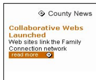
Figure 3.7 Category After Formatting