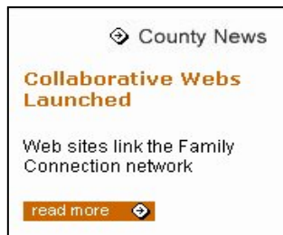
Figure 3.6 Category Before Formatting