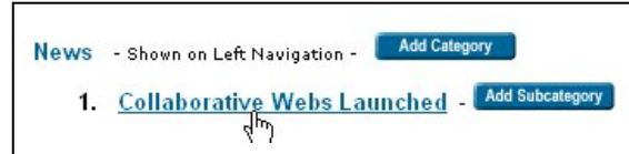
Figure 3.4 Collaborative Webs Launched